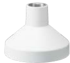
WV-QSR501F-W Mount Bracket