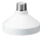
WV-QSR501M-W Mount Bracket