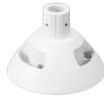
WV-QSR504-W Mount Bracket