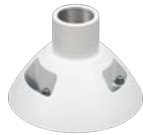
WV-QSR504F-W Mount Bracket