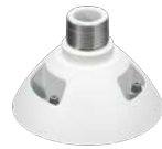
WV-QSR504M-W Mount Bracket