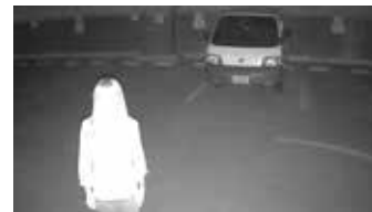
Conventional IR technology (cannot identify close objects due to overexposure)