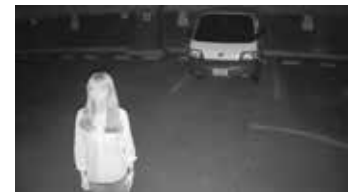
Advanced IR technology (can identify close and distant objects)