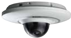
N233ZD / N233ZDP 2.1MP Micro PT Dome IP Camera