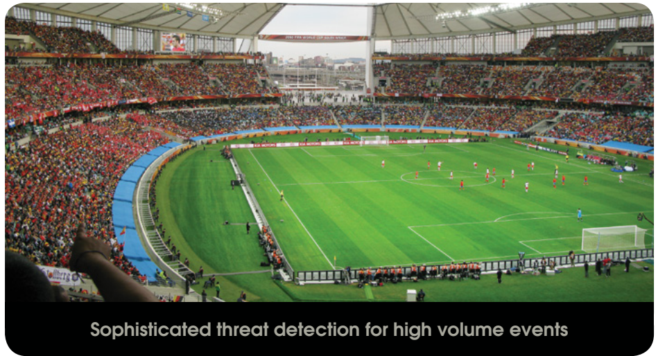
Sophisticated threat detection for high volume events