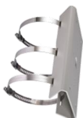
DS-1275ZJ-SUS Vertical Pole Mount